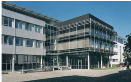
Location: Fraunhofer IKTS Dresden