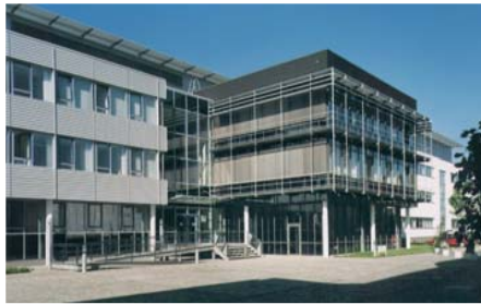
Location: Fraunhofer IKTS Dresden